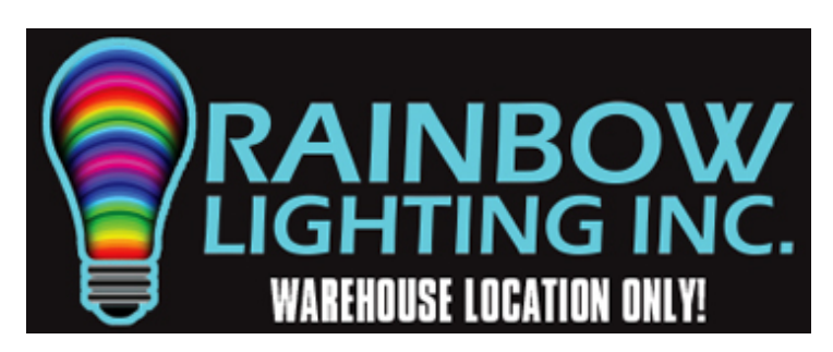
Summer Special now thru Sept 1

Call Lance at MBE 269-344-8800, to get your order in. Ready for pick up in 10 days.